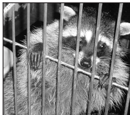
This raccoon was brought to the Pacific Wildlife Sanctuary after becoming blind in one eye.

The city has plans — and always has had — to expand the animal